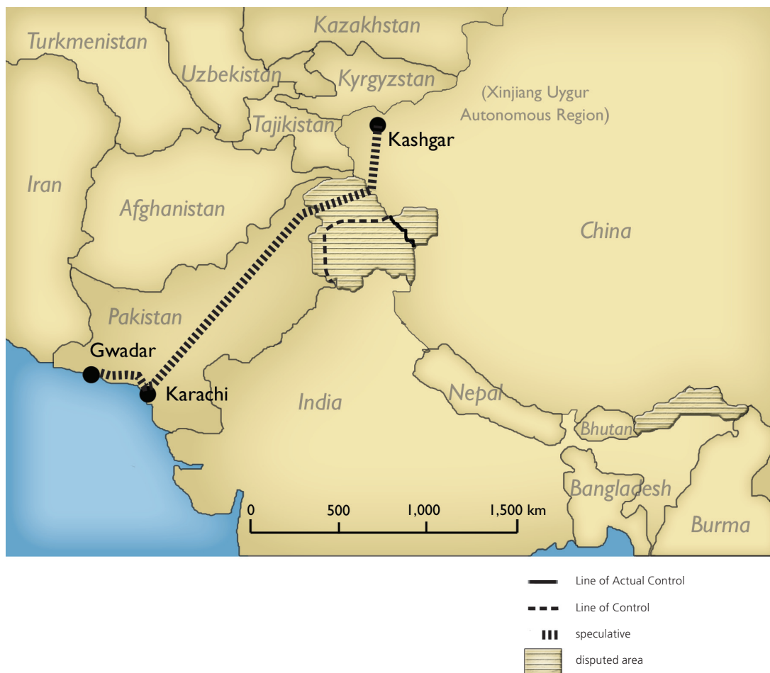
FIGURE 5 PAKISTAN–CHINA OIL PIPELINE: PROPOSED ROUTE

like western and southwestern China; regional fuel deficits could allow them to charge premium rates for fuels produced by refineries at the end of the pipeline. Under these conditions, pipeline plans might be more financially attractive than they are now, with Chinese oil product prices lagging international market prices by 15–20 percent during times of high crude oil prices, such as those of midsummer 2008.