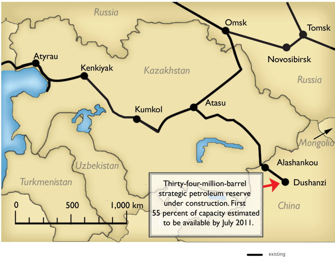
FIGURE 2 KAZAKHSTAN–CHINA OIL PIPELINE: EXISTING ROUTE

oil into the western Chinese market. China wins, because it gains what it sees as “secure” oil supplies; Kazakhstan gains a crude export route independent of Russia and a new market for its oil; and Russian companies gain an additional route for getting western Siberian crude oil production into the Chinese market.